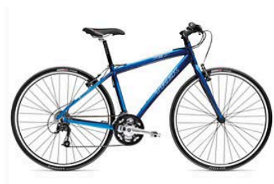
Hybrid TREK FX 7.4 Frame sizes available from 15 to 22.5 inch

You're welcome to bring your own bike if you wish, and we will take care of storing the bike case or box for you while you're on the tour. Please note that the tour cost will not be discounted for bringing your own bike.