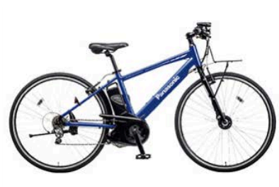
E-bike Panasonic Jetter Frame sizes available from 15 to 20 inch