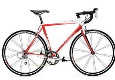
Road TREK 1.2 Frame sizes available from 43 to 60 cm